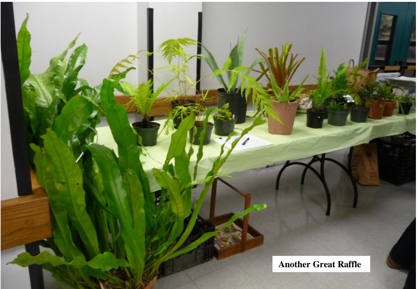
Another Great Raffle